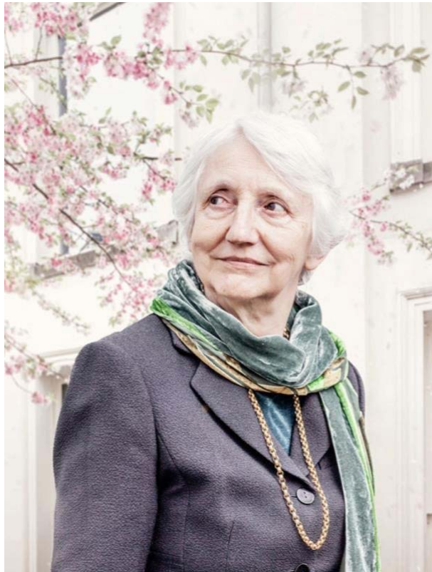
Baroness Onora O'Neill, who gave the Routledge Lecture in 2019