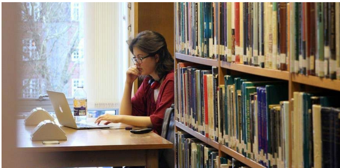
The Casimir Lewy Library

The Casimir Lewy Library is the primary source of printed and electronic material needed for the study and teaching of philosophy in Cambridge. It covers all the areas taught in the Philosophy Tripos as well as most of the areas researched by postgraduates and teaching staff. The library stock, therefore, extends well beyond philosophy itself to cover the interdisciplinary subjects related to philosophy taught and researched in the University.